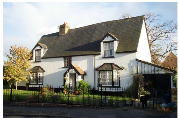
No. 1 Earning Street

4.10 No.1 Earning Street contributes to this softening character. Set back from the road behind a railing, hedge and mature trees, the dwelling has an outwardly Victorian appearance, a result of its dormers and bay windows, although it is actually a 17 th century timber-framed structure. The openness of the large garden is important to the character of this corner plot and distinguishes the edge of the Conservation Area from more conventional residential development in Tudor Road behind.