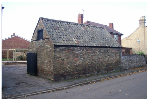
Outbuildings are important contributors to the streetscene

4.20 In this part of the Conservation Area a number of outbuildings are important elements in the streetscene. In particular the outbuilding adjacent to No.15 minimises the visual impact of an otherwise unremarkable dwelling at No.16 and maintains the enclosure of the street.