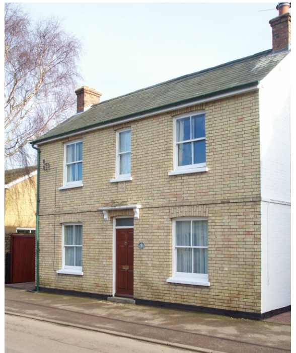
No.3 Earning Street - 19th century buff brick & slate