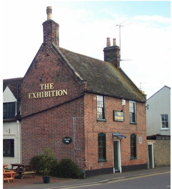
The Exhibition Public House