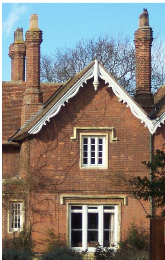
No 4 Cambridge Road

4.6 Nos. 3 and 4 Cambridge Road sit discreetly behind red brick boundary walls and mature tree cover. The walls provide very important definition to the streetscene. No. 3, a timber-framed structure, has authentic medieval origins and dates to the mid 16 th century. Its scale is small and the details simple. In contrast, No. 4, The Grove, is a large, Victorian mansion in an intentionally picturesque style. The exaggerated chimney stacks and ornamental bargeboards typify the playful design. It sits well back in a spacious, private plot, approached through gates and surrounded by mature trees.