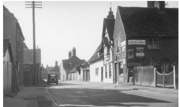
View of Earning Street with Plantagenet House on the right c1949

3.6 The development of Godmanchester has been moulded by its topography. To the east and west, the low-lying water meadows form a natural barrier. Post Street is the principal thoroughfare towards the river crossing and is the route of Ermine Street. A dense form of development has clustered here on the higher ground.