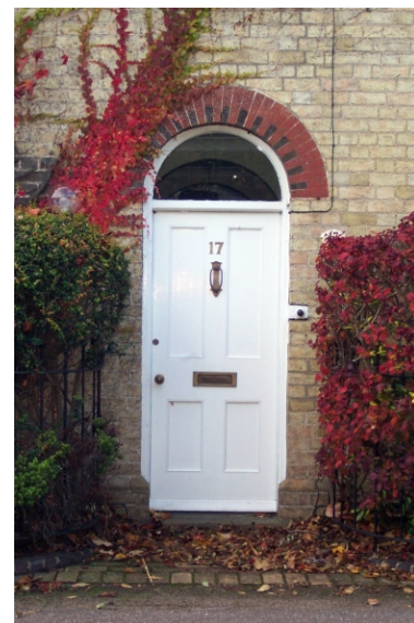
No.17 Earning Street - 4 panel Victorian door