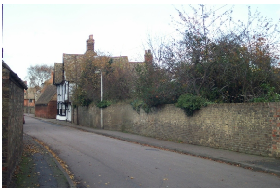
Boundary wall to The Gables

4.18 South of The Gables, the street is enclosed by tall brick walls on both sides. On the east side, the walls and greenery contribute to the 'country lane' character of the street.