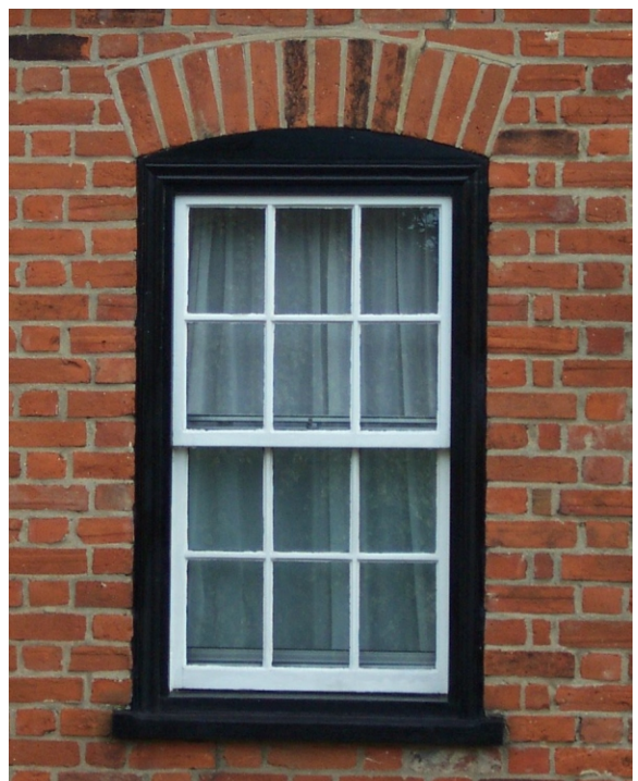
18th century flush sash window

5.3 The 18th century had the most profound impact on the architectural character of Godmanchester as a whole, although its influence in the Earning Street Conservation Area was more modest. With the exception of Dial House, 18th century development is restricted to a number of small scale dwellings. They are constructed in the deep red brick typical of the period, with neo-classical, symmetrical elevations and simple detailing of sashes, brick bands and door surrounds. On the roofs, the predominant materials are local Cambridge mix clay tile for dwellings, with pantiles used on ancillary buildings.