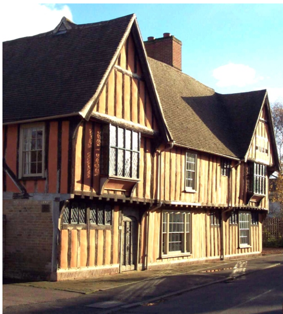
Tudor Farm, Earning Street

4.12 Within Earning Street, Tudor Farm is the most evident landmark building. Completed in 1603 and renovated in the early 1990s, it is described by Nikolaus Pevsner as “the best timber-framed house in Godmanchester” and is listed Grade II*. Its exposed, close-studded timber-frame and earthy limewash dominate the streetscene and provide a rich and dramatic focus. Historic barns to the rear of Tudor Farm have been restored and converted to dwellings.