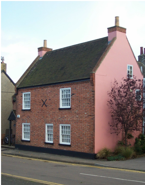
No.9 Earning Street - simpler 18th century brickwork & detailing