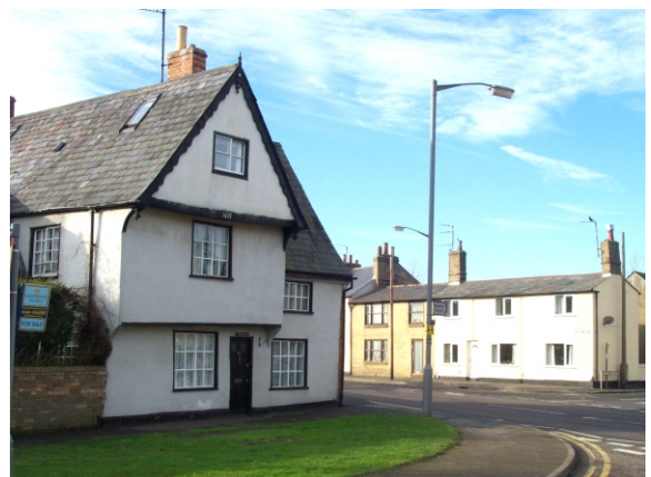
No. 26 Earning Street

4.11 No. 26, on the west side of the junction frames the entrance to Earning Street and provides a stop to westerly views along Cambridge Road. Dating from 1613, it is clearly an important historical building although the external grey render reduces its visual impact in the streetscene.