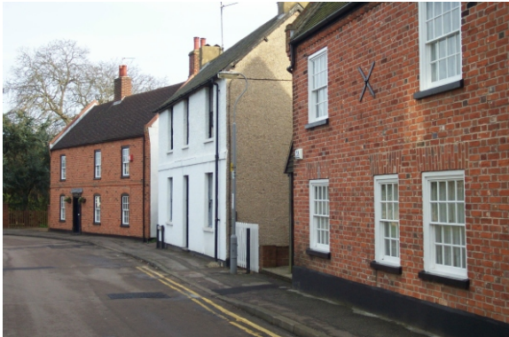
Nos. 7, 8 & 9 Earning Street

4.21 The gentle curve at the south end of Earning Street creates a very attractive streetscene and offers variety in an otherwise straight road. The outside of the curve is formed by Nos. 7, 8 and 9. These are modest examples of their period and help to establish the simpler character of this street.