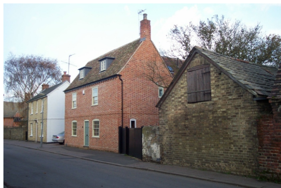
Nos. 3 & 4 Earning Street

4.14 A pinchpoint is formed at the mid-point of Earning Street and the streetscene becomes narrow and enclosed. On the east side Nos. 3 and 4 form an attractive pair. No. 4 is a careful reconstruction of a fire-damaged Georgian dwelling in a rich red brick.