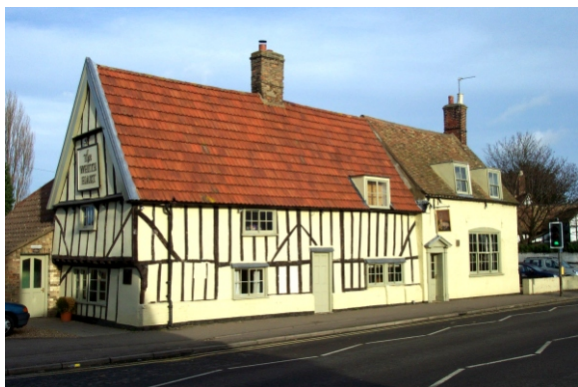
The White Hart

4.5 The junction of Cambridge Road and Earning Street is dominated by the White Hart public house. A part timber-framed and part brick structure. It stands detached and provides a vista