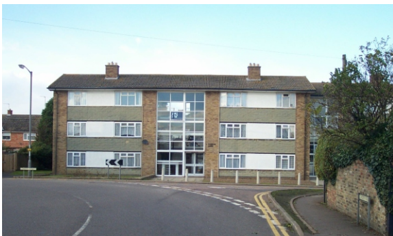
Roman Gate flats

4.22 Just before the junction with London Road, the entrance to Pipers Lane is another weak gap in the enclosure of the street. The wide verges and the scale and design of the Roman Gate flats, excluded from the Conservation Area, are not sympathetic to its setting.