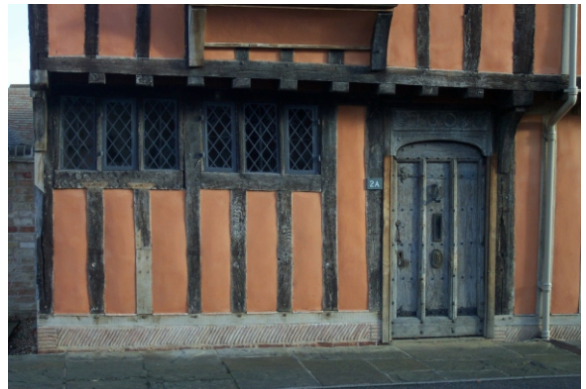
Tudor Farm - early 17th century timber frame