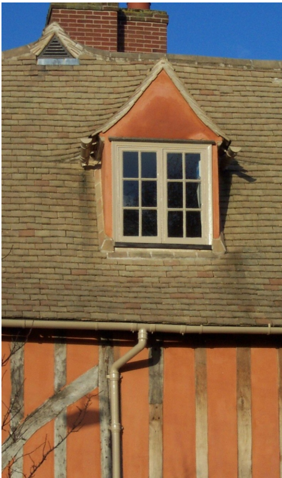
The timber frame, plain tile and gabled dormers of Tudor Farm

5.2 The timber-framed buildings in Earning Street are amongst the finest in the district, displaying close-studding and overhanging 'jetties'. The timber-framed elements within the streetscene are extremely important, reflecting the wealthy patronage of the yeomanry who built dwellings here in the late 16th and 17th centuries. These buildings are now roofed in the local Cambridge mix plain tile.